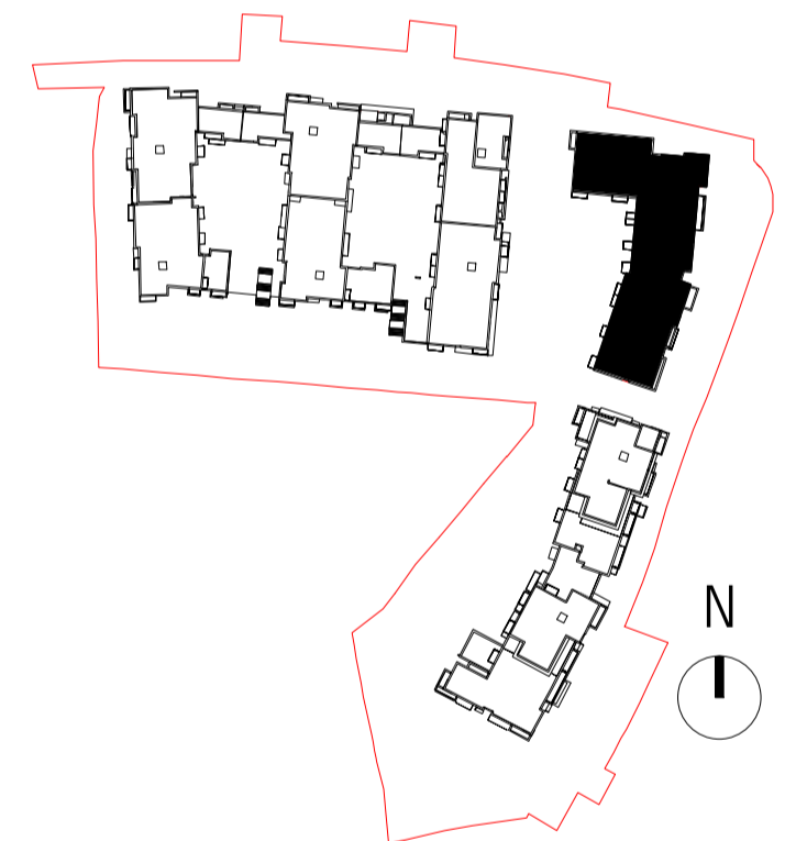
Key Plan 1 : 2500